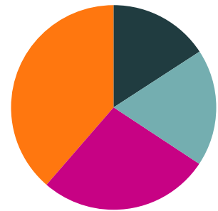
Practicum Exam (PRAC 2.0) 120 Questions | 4 Hours to Complete