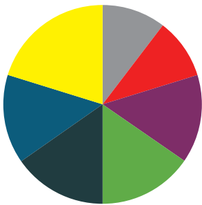
Interior Design Fundamental Exam (IDFX) 125 Questions | 3 Hours to Complete