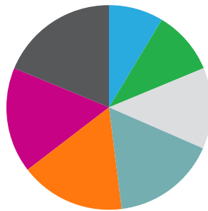
Interior Design Professional Exam (IDPX) 175 Questions | 4 Hours to Complete